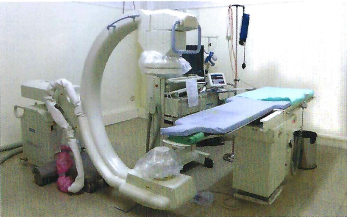
Coronary angiography equipment installed in Dakar. This wide investment has been financed by la Chaîne de l'Espoir, the LCIF, France and Senagal Lions Clubs and other Médico partnerships.

Médico collects and ships medical supplies in developing countries.