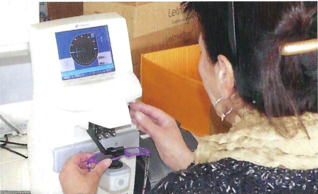
Glass correction being checked on a frontofocometer.

After being sorted at Le Havre's workshop, selected glasses are cleaned, calibrated, identified, and put into bags so that missionary doctors are able to react quickly at the patient's needs.