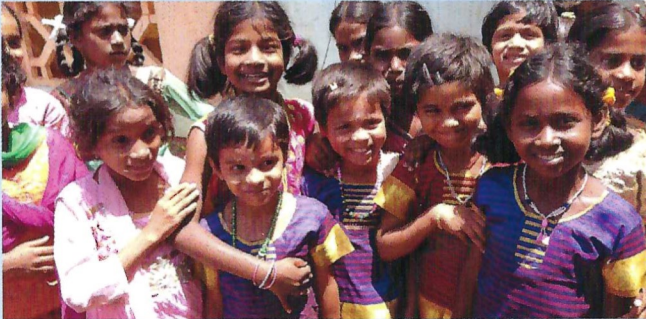
Center of Pudhu Punal in South-East India.

Médico organises caritativ missions in India, Madagascar, Laos