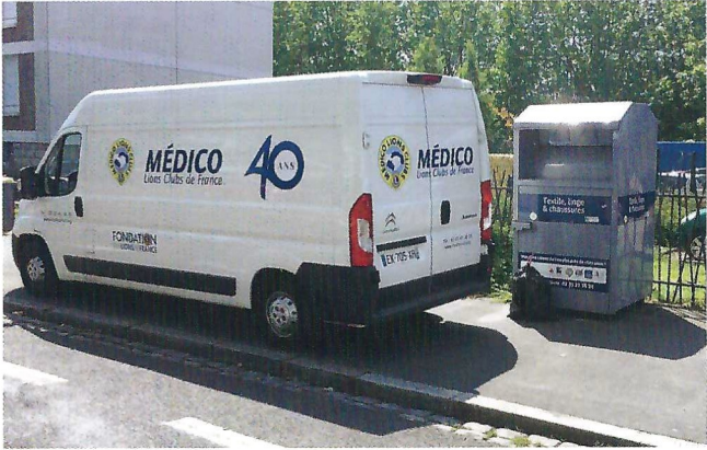
40 boxes have been installed at Le Havre by associations like Grenier, Emmaüs, la Croix Rouge... Médico has acquired 6 units of those.

Médico plans punctual fabrics collections made by Lions Club.