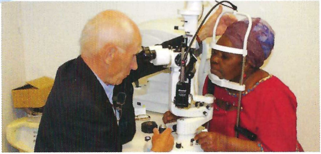
Médico organises ophthalmic diagnostics for people that don't have social security coverage in order to equip them. Since march 2017, Médico achieved 110 opthalmic diagnostics.